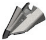
2823 2 1/2" Paired Row 5/8" Vertical Separation