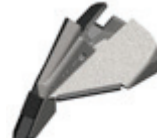
2831 3 1/2" Paired Row 1 1/2" Vertical Separation