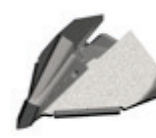
2827 5" Paired Row 3/8" Vertical Separation