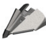
2825 3 1/2" Paired Row 3/8" Vertical Separation