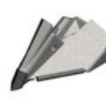
2819 - Left 2821 - Right 1 3/4" Side Band 3/8" Vertical Separation