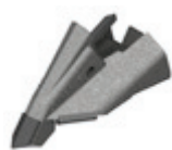
2850 2 1/2" Paired Row 3/4" Vertical Separation