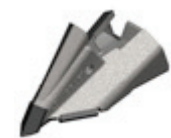
2823 2 1/2" Paired Row 5/8" Vertical Separation