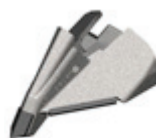
2829 3 1/2" Paired Row 3/4" Vertical Separation