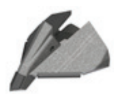
2857 5" Paired Row 3/4" Vertical Separation