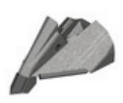
2855 - Left 2853 - Right 1 3/4" Side Band 3/4" Vertical Separation